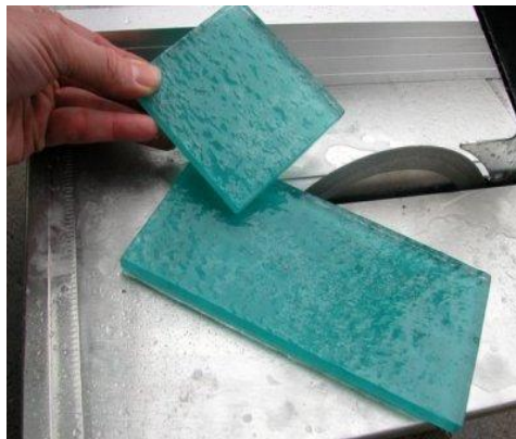
Perfect Cuts on Glass Tile

A Glass Tile Blade is a continuous rim blade like a porcelain or ceramic tile blade, but has a softer matrix, smaller diamonds and is thinner, to provide a chip free cut on the hard and brittle glass tile. A WET saw must be used.